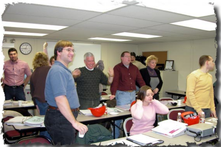
After a long morning session, its time for a S - T - R - E - T - C - H!