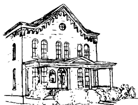
Tioga County Development Corporation

15 in Mansfield after the resurfacing project, the "town and gown" relationship between MU and Mansfield borough, County food pantries, dental health care in the County, health insurance costs for small businesses, wind farms, obesity within the County, gas drilling effects on the water supply and gas lease payments, and lack of food donations at the Blossburg food pantry. Thirteen people were able to explore quite a variety of issues pertaining to this area.