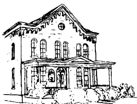
Tioga County Development Corporation