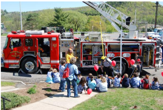
3rd and 4th Grade students listen to the Mansfield Fire Crew talk about their Tanker Truck

On Wednesday, May 13, 2010 nearly 1,000 elementary school students from Tioga County will swarm Mansfield University for Vehicular Career Day.