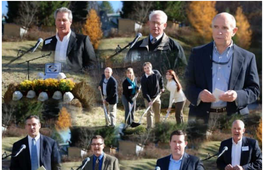
Above: Various Photos from the Groundbreaking Ceremony on November 9, 2011

In October, Tioga County Development Corporation was awarded a $500,000 Redevelopment Assistance Capital Program Grant. The total project cost is estimated at $15 Million.