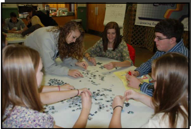
Pictured Above are students in the YLP Class of 2012 participating in the PSU Learning Today, Leading Tomorrow Leadership Styles Puzzle exercise.

On November 8, 2011 the Tioga County Development Corporation Leadership Tioga County Youth Leadership Program Class of 2012 learned about Health Services in Tioga County during Session 2 at St. Paul’s Episcopal Church in Wellsboro.