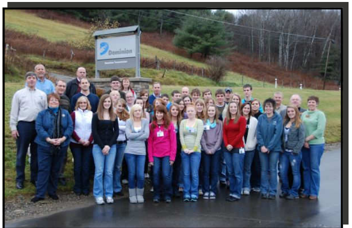
Pictured Above are students & staff of the YLP Class of 2012, along with Dominion Transmission Staff, in front of the Sabinsville Office.

Session 4 Teens & The Law will be held at the Tioga County Courthouse and the Tioga County Prison on Wednesday, January 4, 2012.