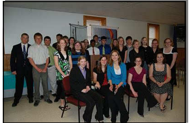
Youth Leadership Program Class of 2008

The students completed a nine-month program beginning with a S'More Event in August 2007 and ending with their Graduation Ceremony.