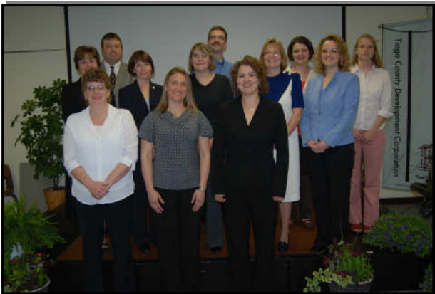
Community Leadership Program Class of 2008

The Tioga County and Graduation Ceremony.