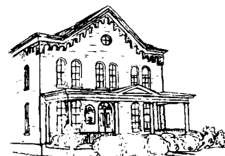
Tioga County Development Corporation