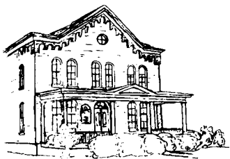
Tioga County Development Corporation