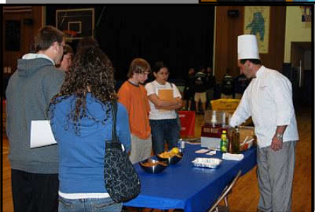
10th Grade Students at the Southern Tioga School District Career Fair explore different professions through hands-on activities and demonstrations.

STSD students study careers in a required course titled "Career through the PA Educational Improvement Tax Credit Program. Almost two dozen local presenters, from careers such as food service, the trucking industry, and photography, brought examples of their work and/or tools of their trades to share with the students. Over 150 tenth grade students had the opportunity to spend 15 minutes with five career presenters that they choose ahead of time. Presenters readily shared their career experiences and advice for young people anticipating entry into those career fields. STSD students study careers in a required course titled "Career through the PA Educational Improvement Tax Credit Program. Almost two dozen local presenters, from careers such as food service, the trucking industry, and photography,