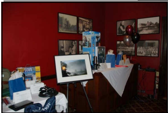
Left: TCDC's famous door prize packages. 6 Door Prize Packages valued in excess of $4,395.00 from 24 Local Businesses & TCDC Members.

Nearly 200 TCDC Members and Supporters attended 20th Anniversary Celebration!