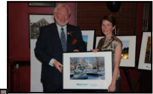
Northwest Savings Bank