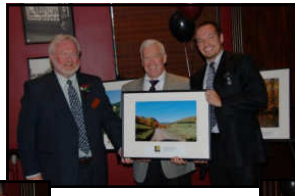
Larson Design Group