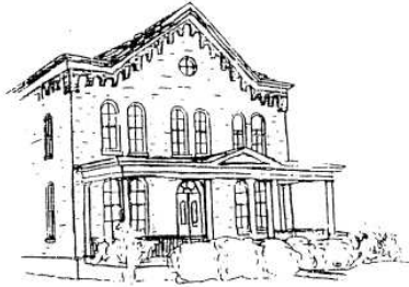
Tioga County Development Corporation