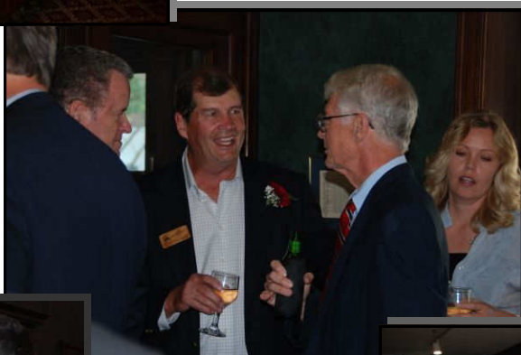
Left & Below: Guests enjoy conversation during the social networking reception of TCDC's 18th Annual Meeting

Nearly 200 TCDC Members and Supporters attended 20th Anniversary Celebration!