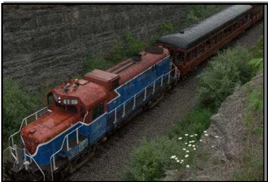
The Tioga Central Railroad, located at 11 Muck Road, Wellsboro, PA. For more information visit their website at www.tiogacentral.com

The Tioga County Development Corporation (TCDC) will hold its 4 th Annual Meet Our Member Mixer on Wednesday, September 14, 2011. The Mixer will be held on the Tioga Central Railroad Excursion Train, 11 Muck Road, Wellsboro, Pennsylvania. This event is FREE for all TCDC Members.