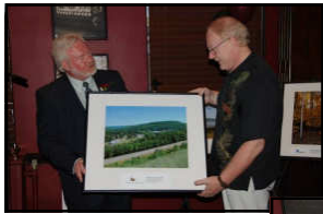
Ward Manufacturing LLC